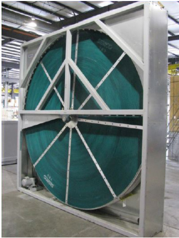
Total Energy Wheel developed by SEMCO.